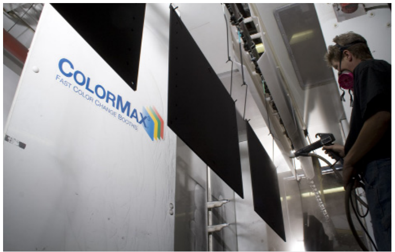
Where color changes used to take two hours, SK now changes colors in under 10 minutes with dark-to-dark changes and in 15 minutes with black-to-white color changes, with no contamination, using the ColorMax® System.

The two new systems allow SK to cost effectively coat any part, while increasing production and reducing powder usage. Where color changes with its reclaim system used to take two hours, SK is now changing colors in less than 10 minutes with dark-to-dark changes and in 15 minutes with black-to-white color changes, and with no contamination. The ColorMax system has several features for faster color changes and reduced powder usage. A non-