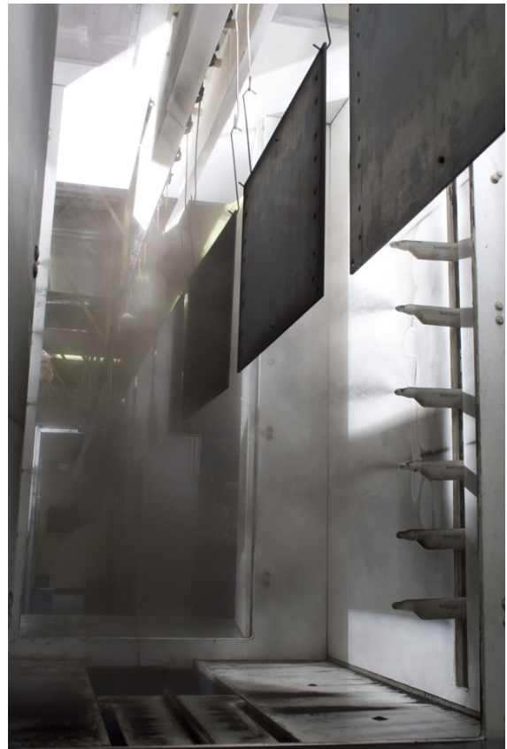
For control of the automated line, the iControl® system's single touch-screen graphical interface provides SK operators with digital control of application parameters.

"We've had to learn to step up our game because of the new equipment. I can't imagine life without it. We can do any color and we don't care how large or small the job is," explains Mahoney. "We make money every day when others say they can't."