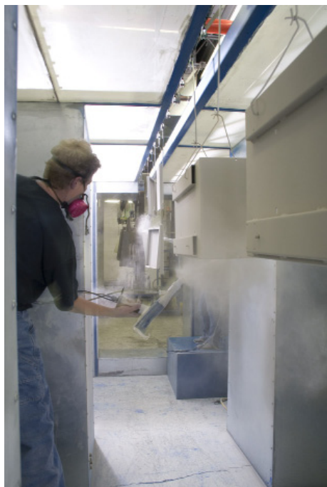
The new systems have increased productivity for SK while reducing costs by dropping from three shifts to two. Plus, powder usage has been reduced, with savings of 60 to 75 percent. Before, SK used 8,000 pounds of powder per month; now it uses 2,000 pounds per month.

Faster color changes and high first pass yield have translated into better line utilization. Instead of spending valuable downtime changing colors, SK is coating more parts.