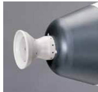
Unique hourglass-shaped composite cup holds the key to painting efficiency.

The turbine speed sensor uses fiber-optic cables and magnetic pick-up, which provides superior resolution and reliability. In addition, turbine-speed drops are minimal between spray and no-spray conditions, which enhances finish quality. This is particularly important with systems that employ automatic triggering systems.