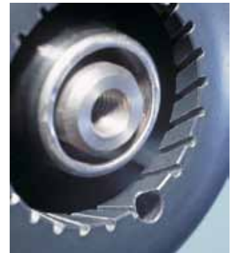
The RA-20 rotary atomizer uses vector air to control pattern shaping,