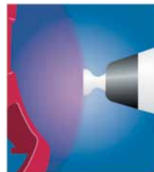
Nordson RA-20 rotary atomizer.