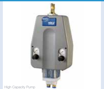
High Capacity Pump

The Prodigy HDLV gun range consists of a high efficiency dense phase manual gun, a straight-through powder path short version for robot applications and also a longer automatic gun for extended reach inside the booth. Prodigys' advanced nozzle technology produces unbeatable first pass transfer efficiency and consistent film build.