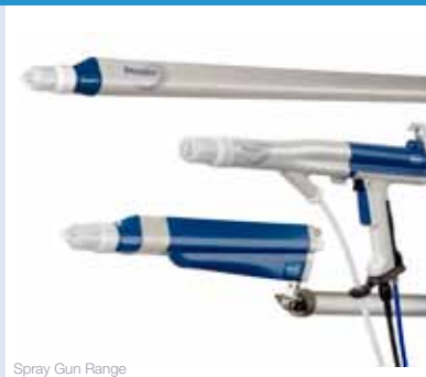
Spray Gun Range

At the heart of Prodigy technology is the unique dense phase gun pump. Pneumatically operated, it dispenses powder to the gun at a constant rate over time as it doesn't use any wearing venturis. Designed to self purge and colour change in only 20 seconds without disassembly, the pump ensures process control, at the lowest operating cost.