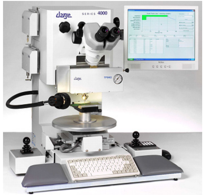
Nordson DAGE 4000 Bondtester and solder bump shear test