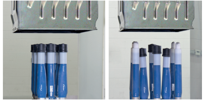
Encore HD-PE multi-gun arrangements for coating cavities

An adjustable mounting bracket enables automatic gun positioning from 90- degrees up (from parallel to gun bar) to 90-degrees down, to efficiently coat the tops and bottoms of parts. The bracket also enables "lead and lag" positioning for improved coverage on part edges.