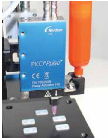
Tool-free latch simplifies serviceability, reduces downtime.

The PICO® Pulse ™ contact dispense valve delivers faster, more precise dispensing with less turbulence for greater fluid deposit consistency, placement, and process control. Dispense micro-deposits as small as 0.5 nL at up to 1000Hz continuous with up to 1500Hz maximum bursts* – an industry best in class.