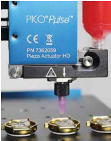
Dispense micro-deposits as small as 0.5 nL.