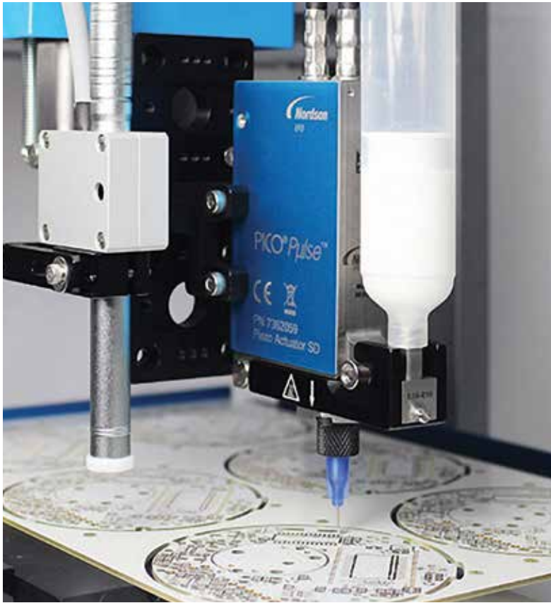
The PICO Pulse contact dispense valve provides precise, high-speed dispensing.

The Latest Advance in Precision Contact Dispensing Technology