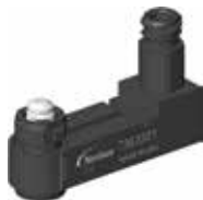
PEEK fluid body assembly