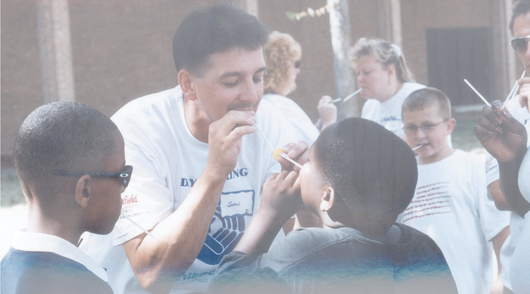
Lorain County United Way Day of Caring with Big Brothers Big Sisters – Little's Learning the LifeSaver Game