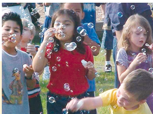
Norcross Elementary School of Excellence Celebration

Within these geographic areas, granting priorities are driven by community needs. Although needs can change quickly, our vision is long-term. We pursue and support results-oriented opportunities that prepare individuals for full and equal participation in the economic and social mainstream. We believe these kinds of programs help improve the quality of life over the long-term and produce stronger, more enlightened communities in which to live and work.